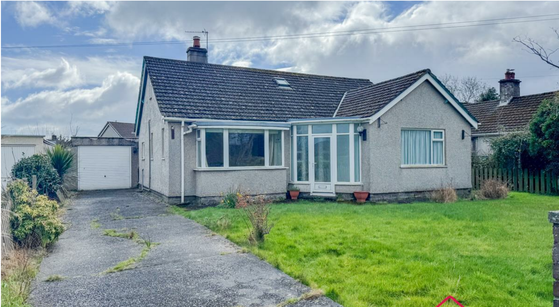
72 Bride Road, Ramsey, Isle Of Man, IM8 3LB Asking Price £357,500